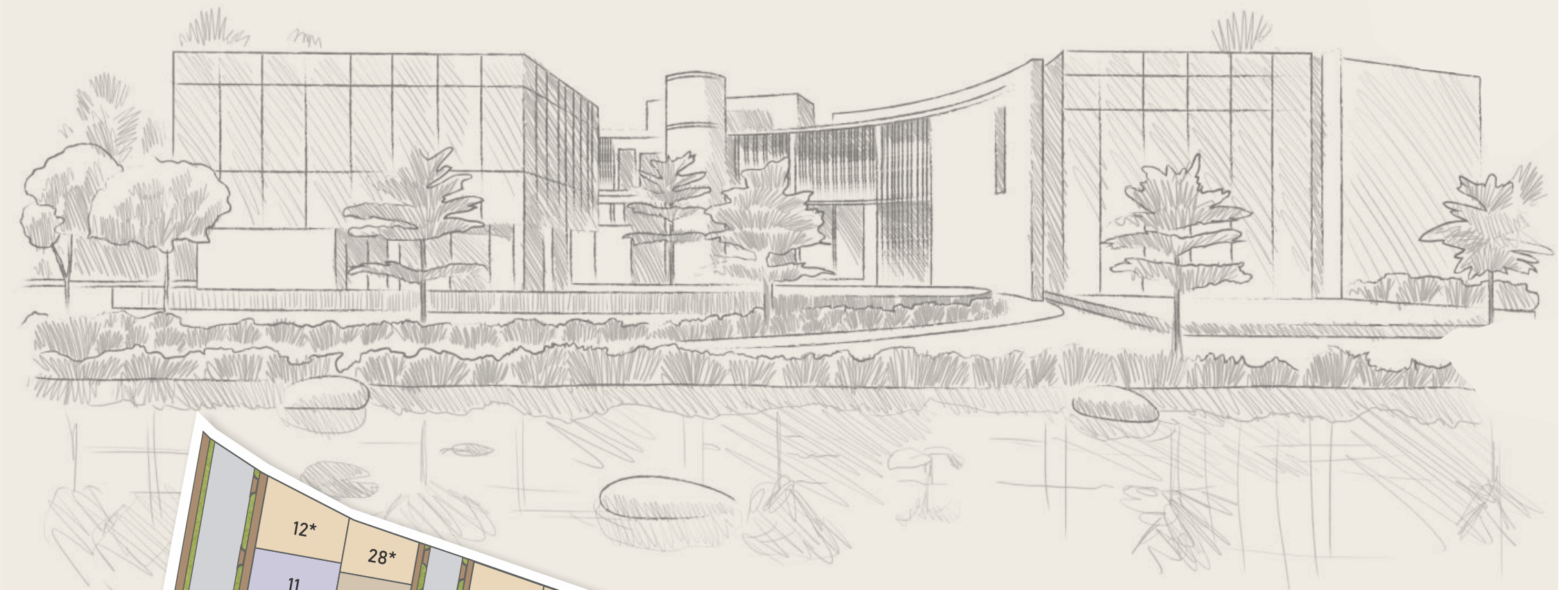
CLUB HOUSE (ARTISTIC IMPRESSION) Membership Optional*